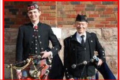
Callander Legion Pipes & Drums at the 20th Annual Powassan Maple Syrup Festival